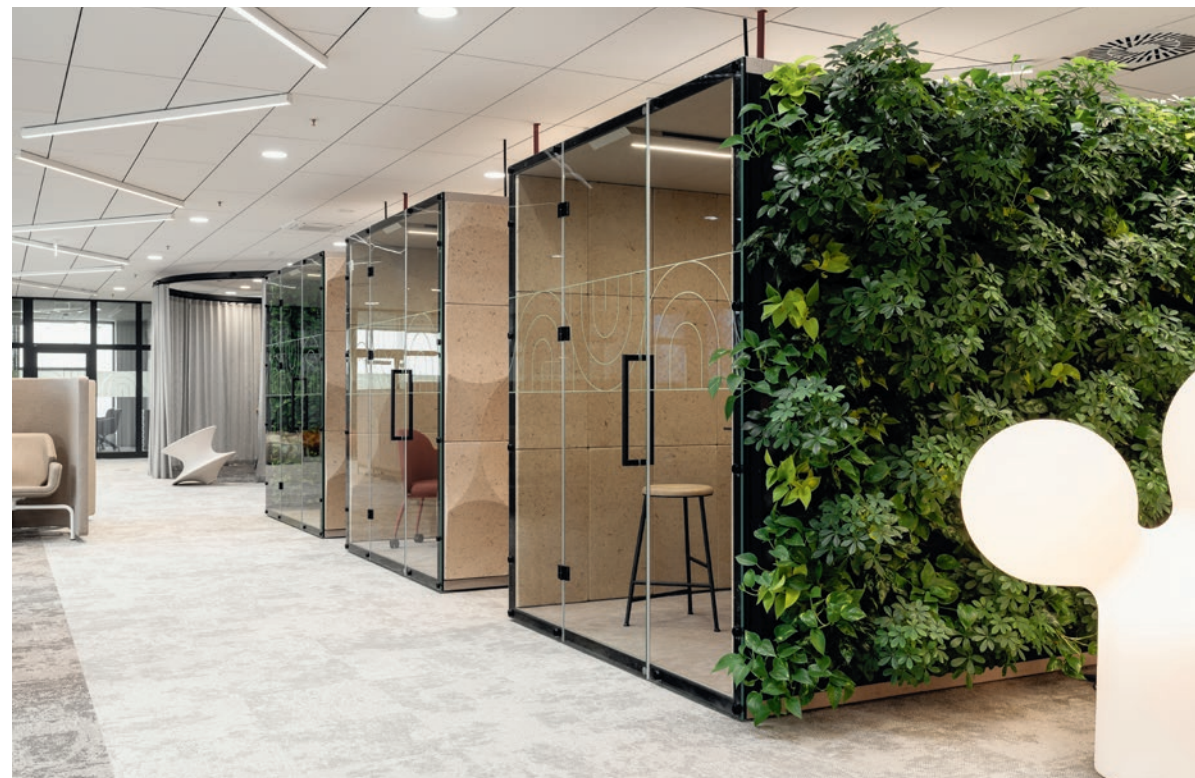
CLIENT: FASHION E-COMMERCE INTERIOR DESIGN: HOOF