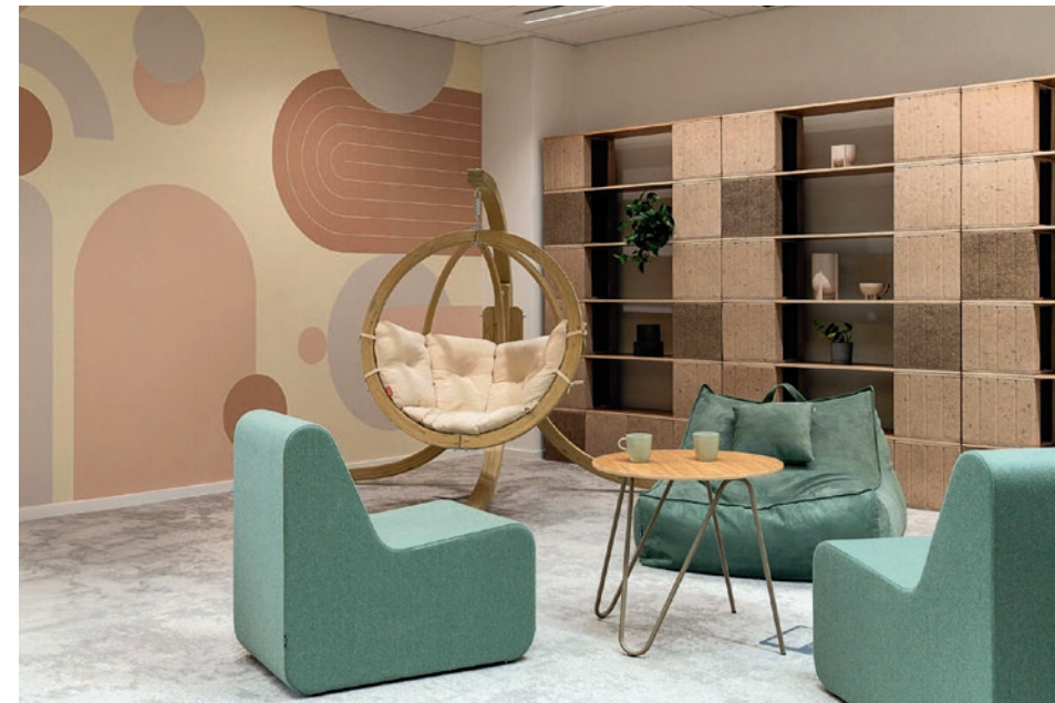
CLIENT: FASHION E-COMMERCE INTERIOR DESIGN: HOOF