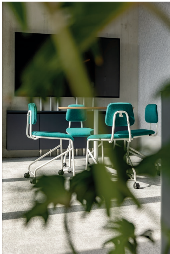
CLIENT: CONTENTFUL, BERLIN INTERIOR DESIGN: TOI TOI TOI CREATIVE STUDIO