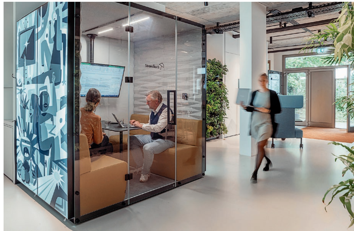
INTERIOR DESIGN / CLIENT: workingwell, MUNICH