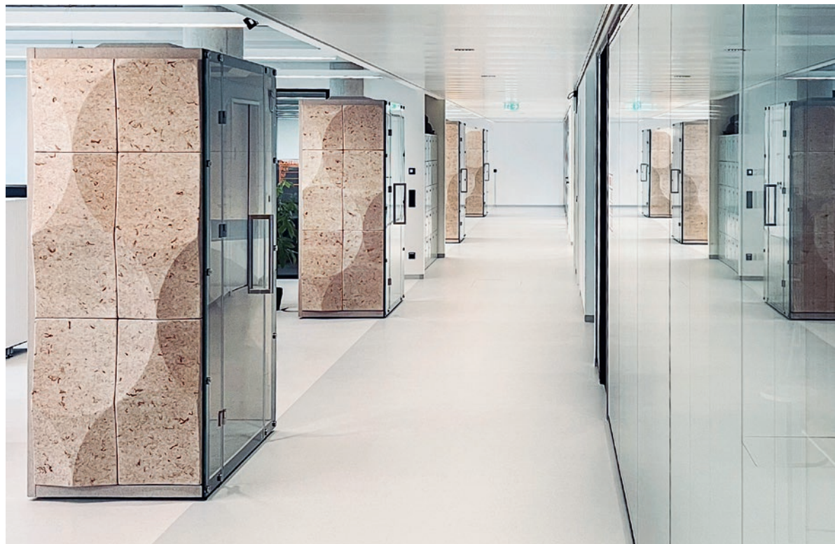
CLIENT: CAPMO, MUNICH INTERIOR DESIGN: RHV GROUP