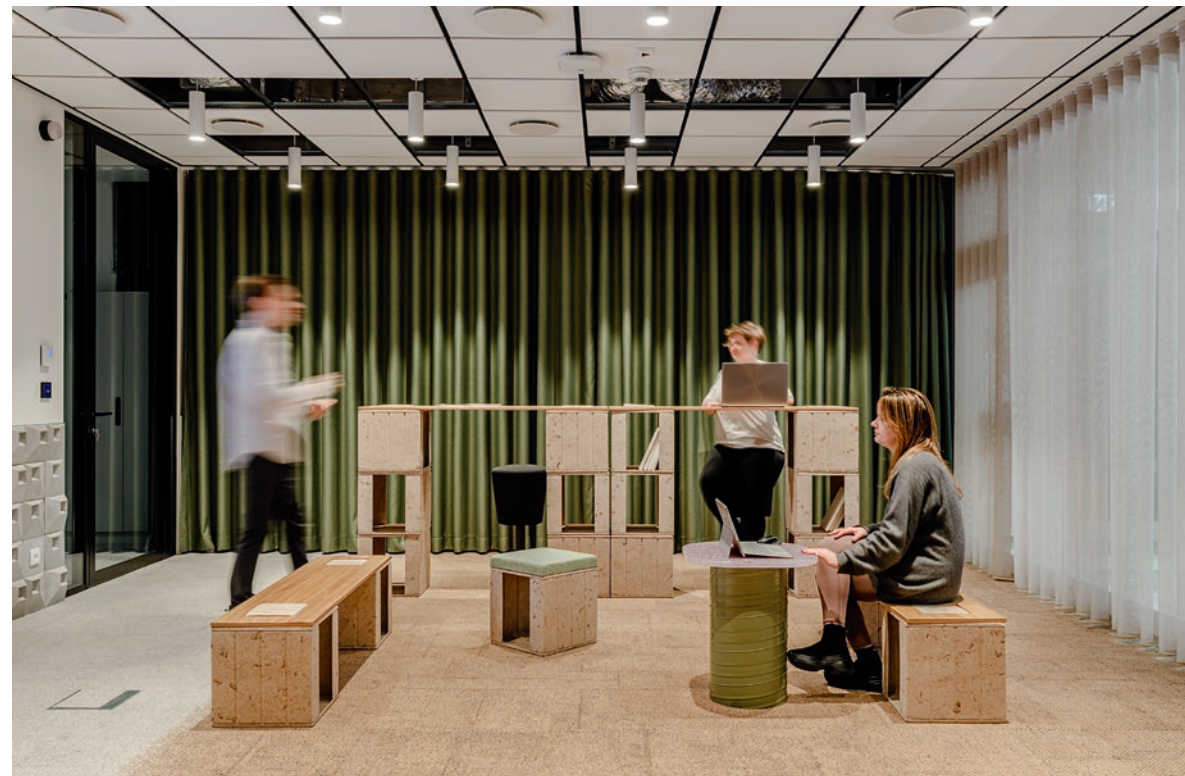
CLIENT: ARUP, WARSAW INTERIOR DESIGN: WORKPLACE