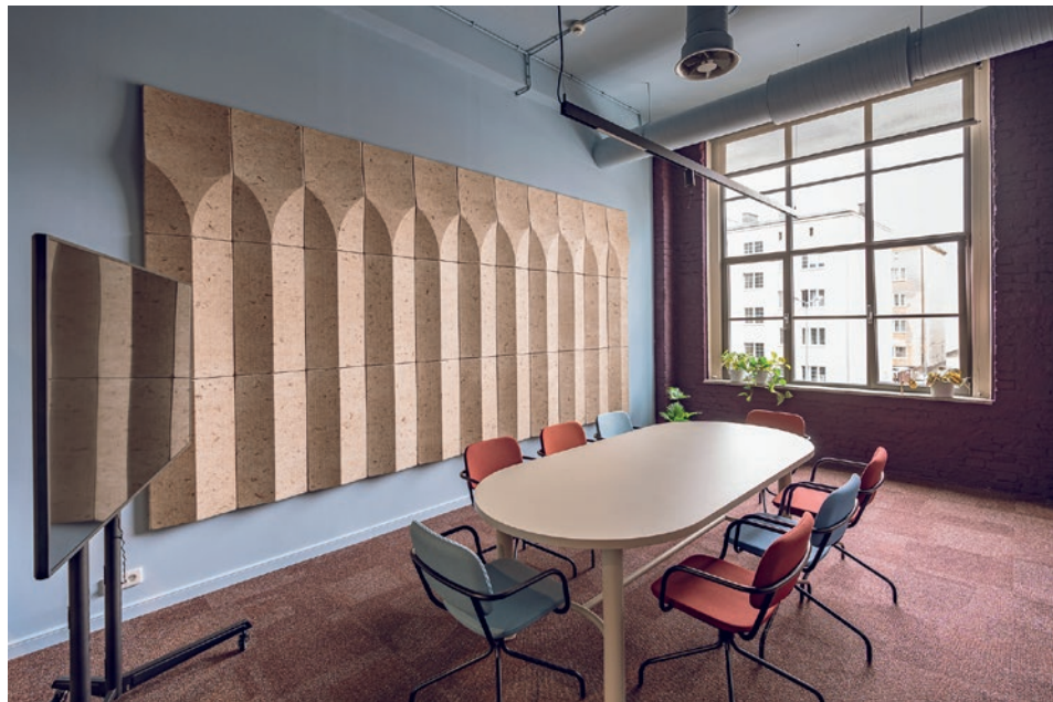
CLIENT: CONCORDIA DESIGN INTERIOR DESIGN: BIDERMANN + WIDE