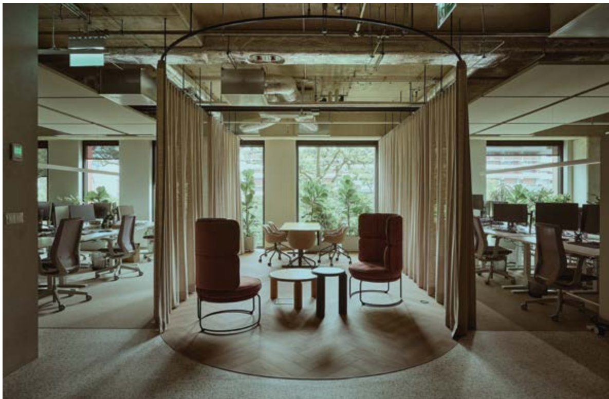
ARCHICOM, WROCŁAW INTERIOR DESIGN: 3XA ARCHITECTS