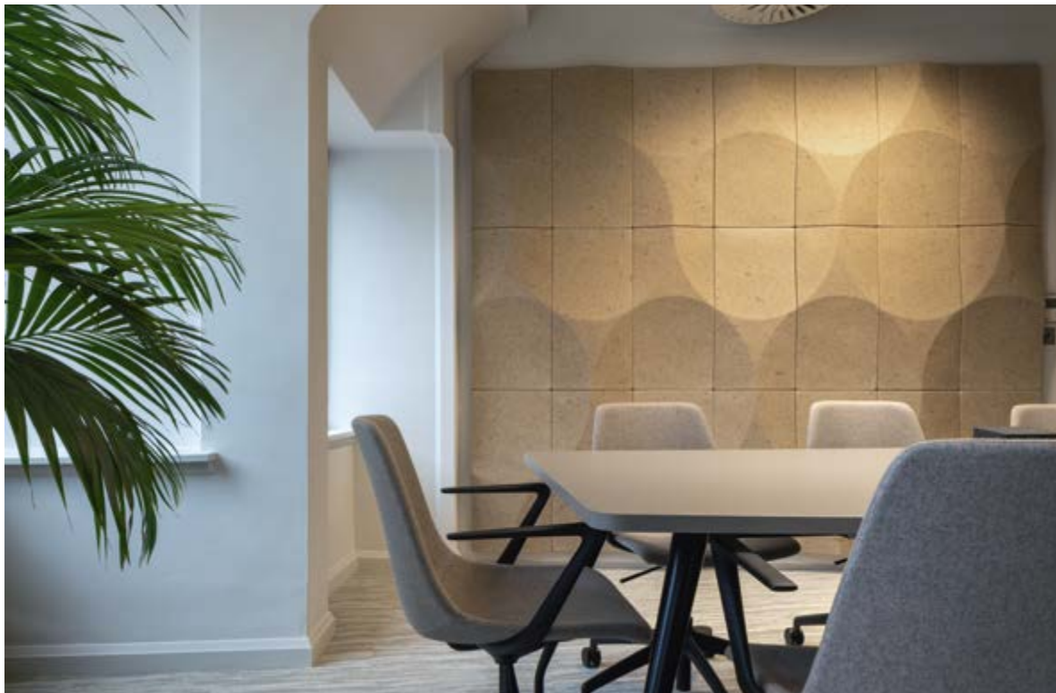
CUNDALL, BIRMINGHAM UK DESIGN: CUNDALL AND OFFICE PRINCIPLES