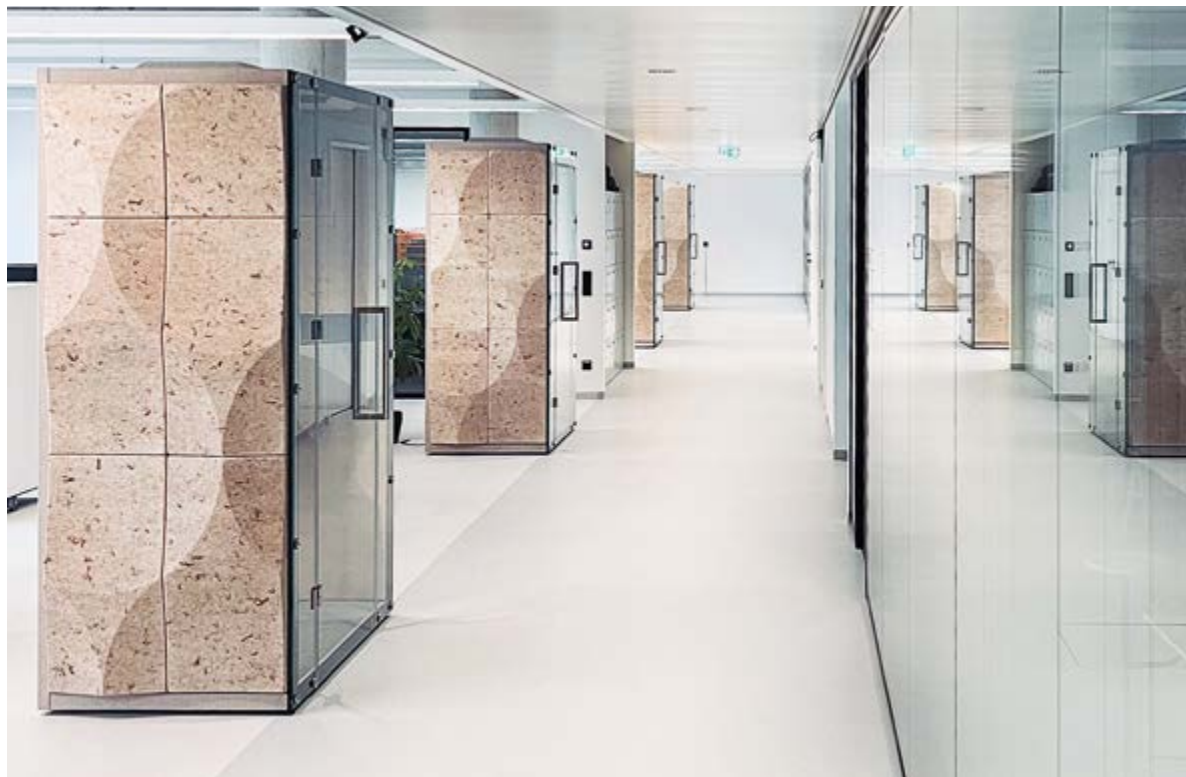
CLIENT: CAPMO, MUNICH INTERIOR DESIGN: RHV GROUP