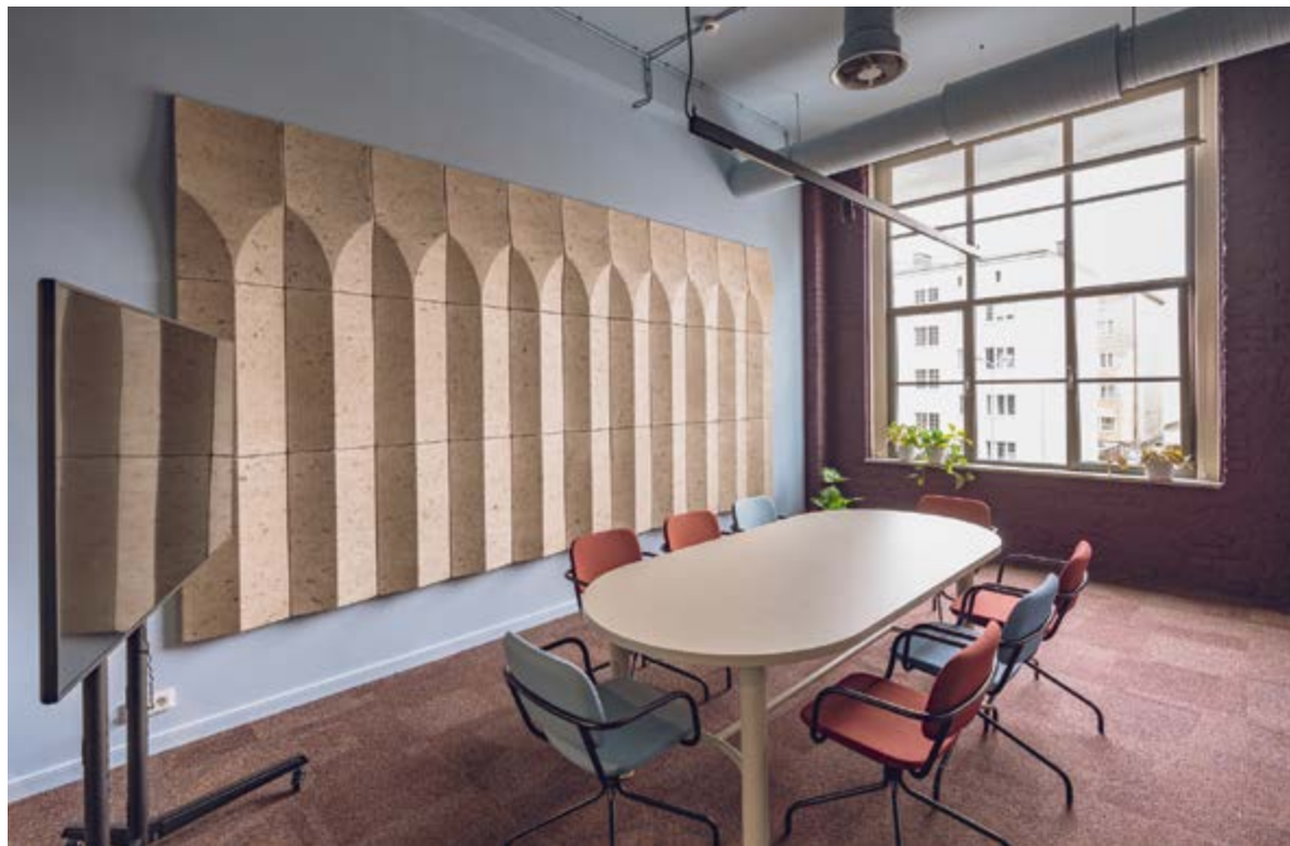
CONCORDIA DESIGN, POZNAŃ DESIGN: BIDERMANN+WIDE