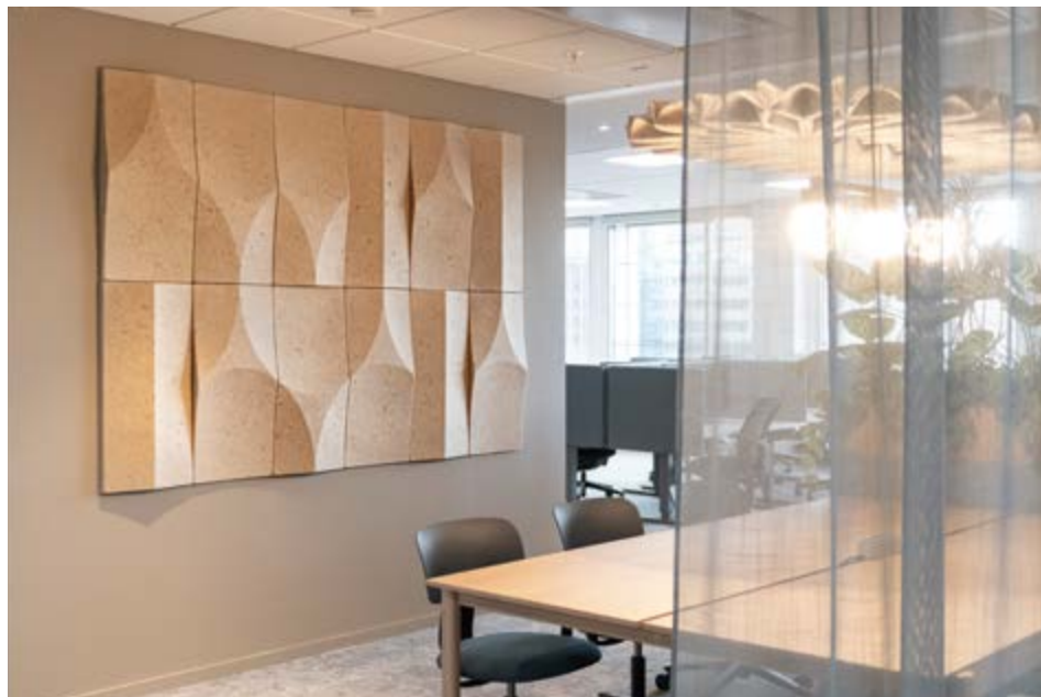
CONSULTING COMPANY (BIG FOUR), OSLO DESIGN: ZINC INTERIOR ARCHITECTS